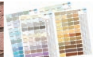
Colour chart for render